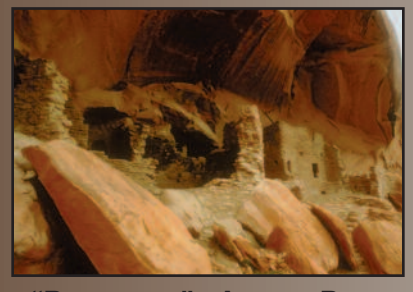
"RIVERHOUSE" - ANASAZI RUINS

Cutting deep through the slickrock country of Utah's legendary Canyonlands, in the heart of Navajoland, the river is characterized by towering redrock canyons and elaborate stratigraphic formations - truly one of the great southwestern rivers.